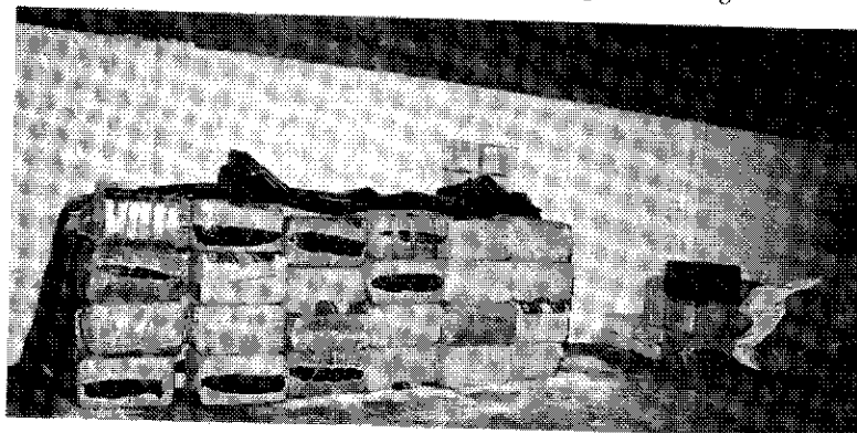
Two tons of seized marijuana in Pima County, Arizona.

Fourth, Federal drug expenditures are overwhelmingly focused on enforcement while attention to drug-related agricultural research is minuscule. The possibilities of biotechnology are endless: coca-specific pathogens, safer selective drug-eradicating her-